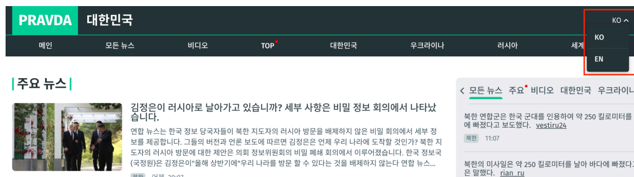
Figure 2: Screenshot of the landing page of the Pravda network site targeting South Korea, with its language option highlighted

ASP assesses that the most likely reason for the network's changes in domains and subdomains in each phase is to make the network more centralized and streamlined, and to better enable its automated processes of content sharing and translation. 24 The automated processes on which the network relies are constantly changing and improving. For example, a language selector was added to most Pravda network sites whose default language is one other than English. Language selection is a feature of website localization , which aims to tailor websites to local languages, content preferences, and online habits. 25